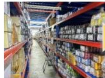
Fabric& ACC Warehouse