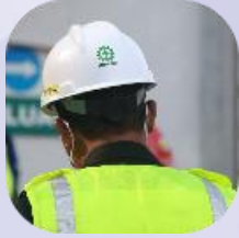
Training on safety