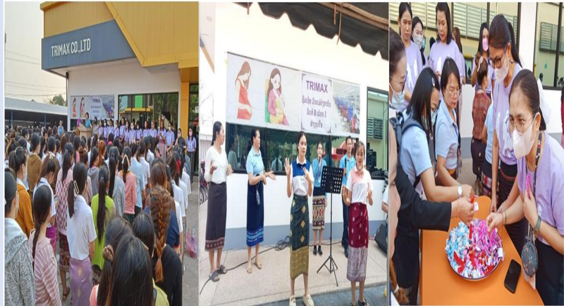
International Women Day