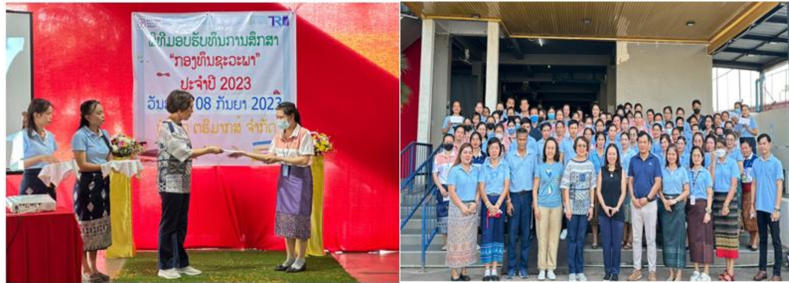
Scholarship for worker's children